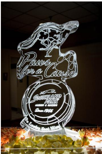
MSGAO took 3rd place in the Paws for a Cause competition.

The boys "pajamas" will also work for outdoor coats. The "pajamas" are inexpensive men's fleece vests (ladies' sizes for smaller greys). Cost: under $10 (I think I got one for $5).