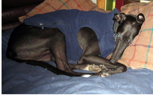
Lazer in his pajamas